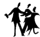
Greeters & Ushers