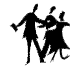
Greeters & Ushers